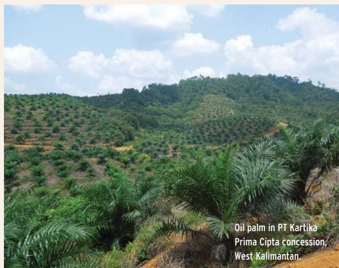
Oil palm in PT Kartika Prima Cipta concession, West Kalimantan.

FPP submitted a complaint against PT Mutuagung Lestari in October 2014. At the time of writing (more than a year later) it had yet to be addressed by ASI and the RSPO due to a failure to determine the correct procedure to follow and slow follow-up by the RSPO Secretariat.