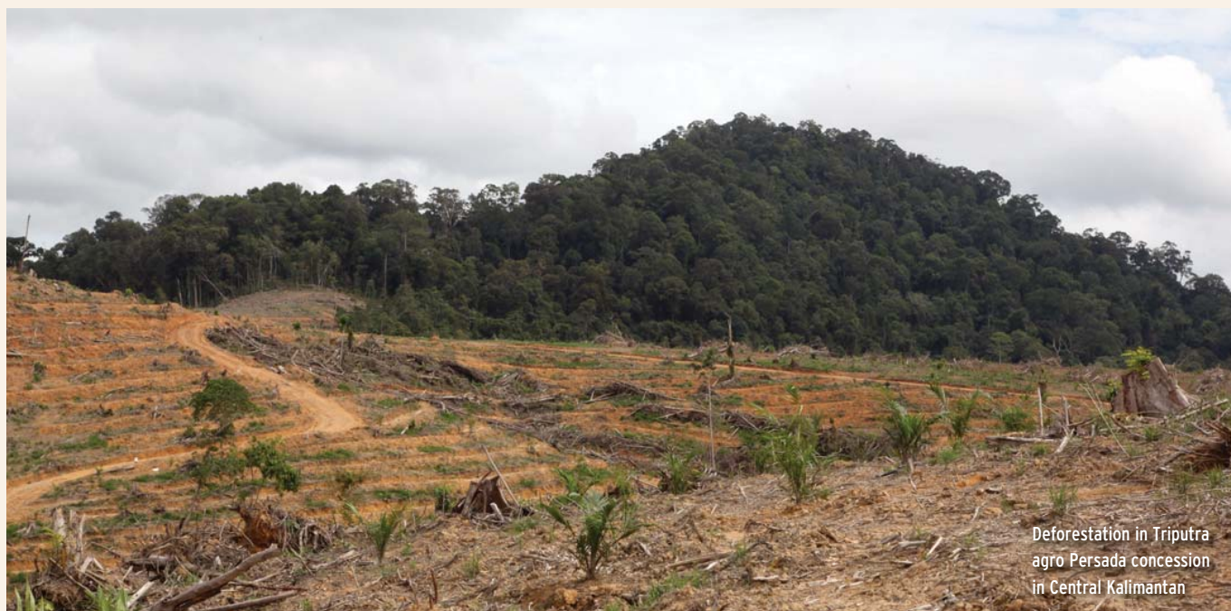
Deforestation in Triputra agro Persada concession in Central Kalimantan