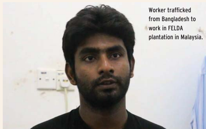
Worker trafficked from Bangladesh to work in FELDA plantation in Malaysia.