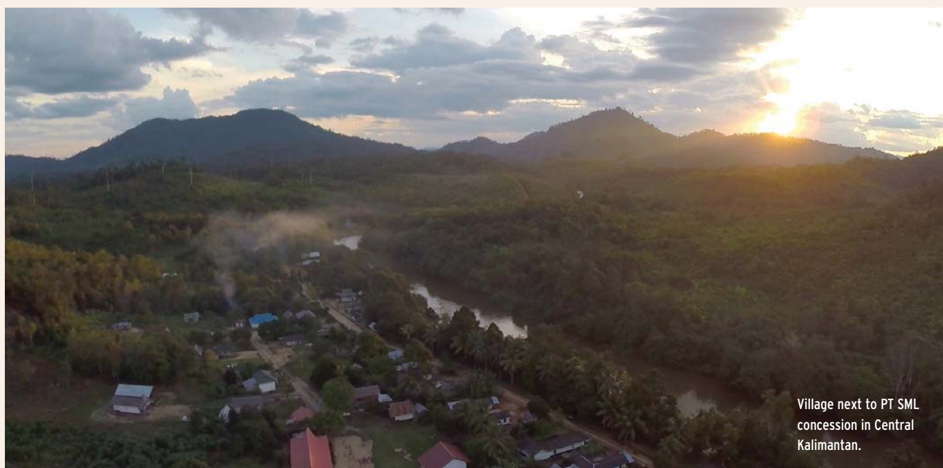
Village next to PT SML concession in Central Kalimantan.

Due to pressure from its main buyers, 37 PT SML subsequently commissioned a "comprehensive orangutan assessment" to be carried out by a credible conservation organisation. This raises the prospect that PT SML is aware that the HCV assessment failed to fully and accurately identify orangutan habitat. PT SSS confirmed to EIA that the survey would be "accommodated in the land use plan", 38 though its HCV assessment may still lay the groundwork for those areas to be cleared.