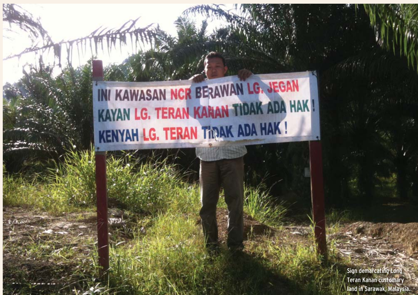
Sign demarcating Long Teran Kanan customary land in Sarawak, Malaysia.