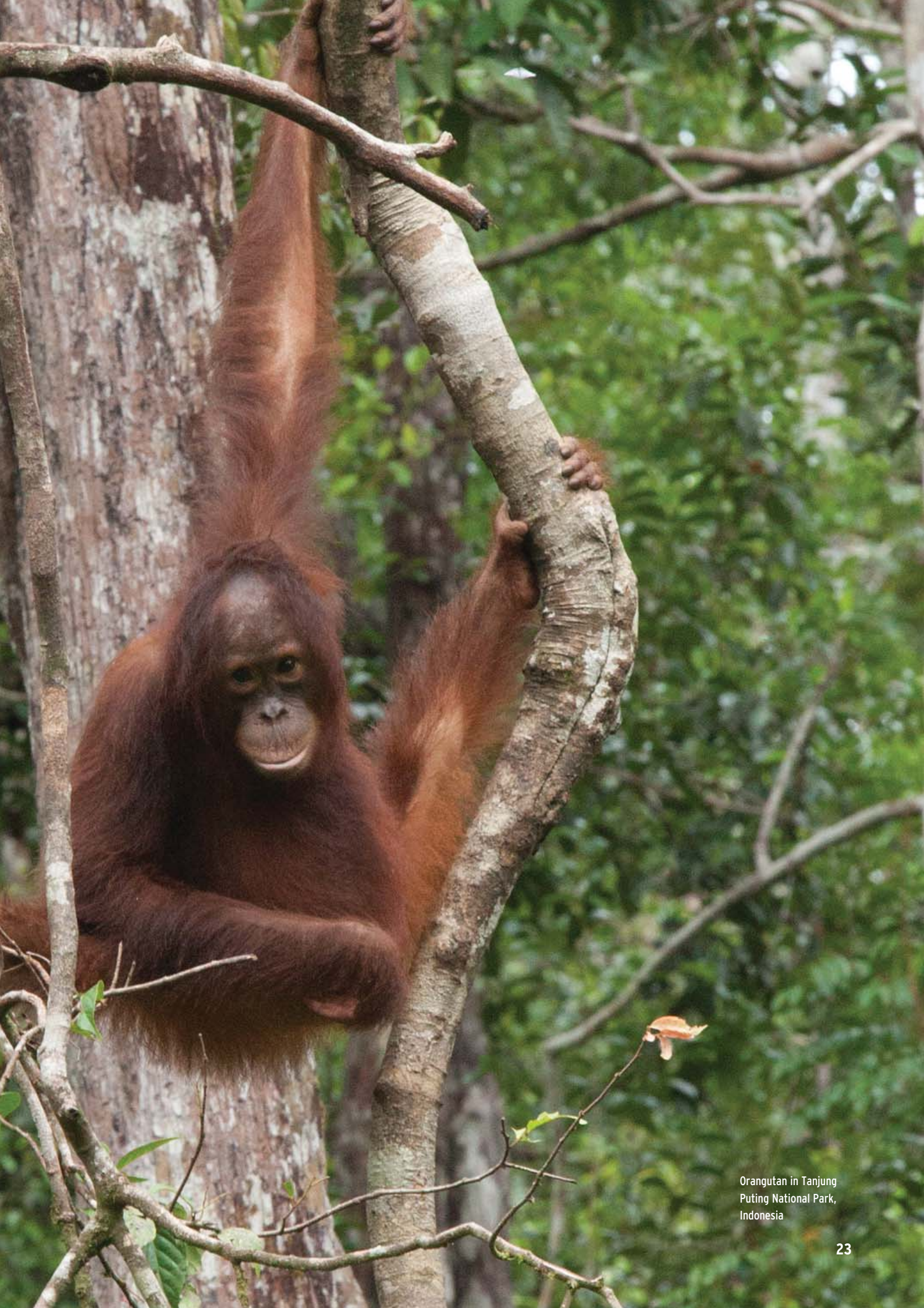
Orangutan in Tanjung Puting National Park, Indonesia