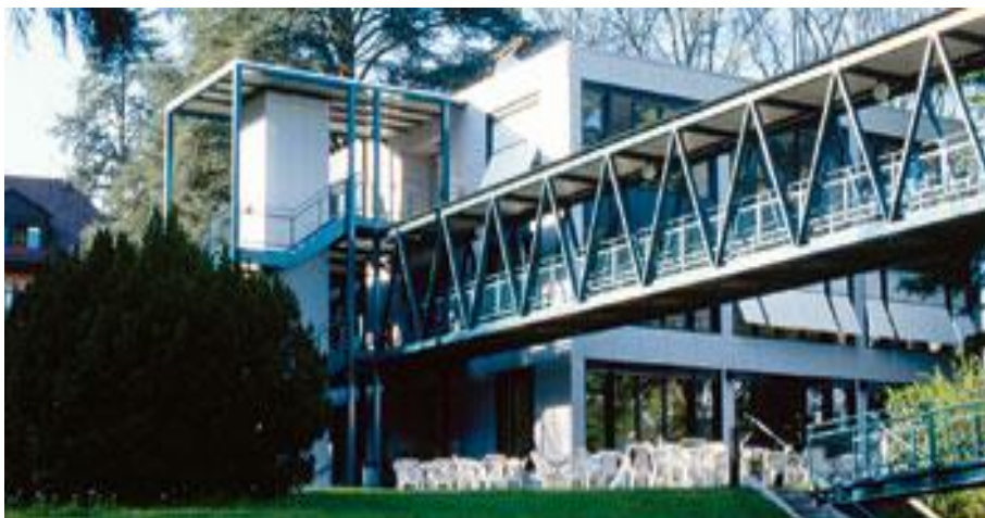
The Living and Learning Center