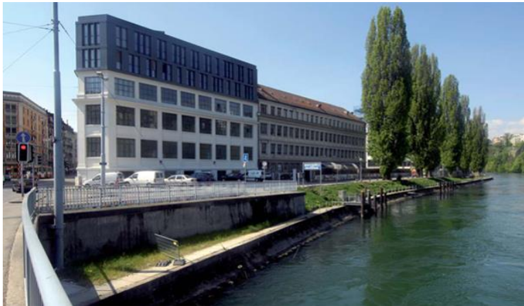
Les Berges du Rhône

Keep walking in the same direction as the tram along the river and the residence is 100m down the street (rue des Deux-Ponts #2). You will have to use the under path to cross the bridge and reach the other side. Once you walk up the under path, you will be facing the residence.