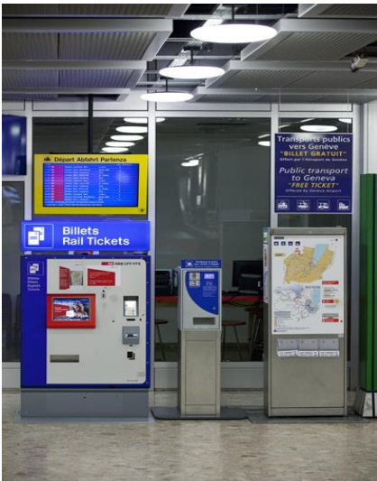
Free Rail Ticket at Geneva Airport!

In the baggage collection area, you may want to take advantage of one of the few free items available for tourists in Switzerland - a free public transportation card valid for 80 minutes. Since it takes about 6 minutes to get to the city center from the airport, unless you plan to take a taxi, you will certainly find this useful.